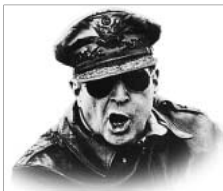
"Mr. Prima Donna, Brass Hat, Five Star MacArthur" Harry S. Truman